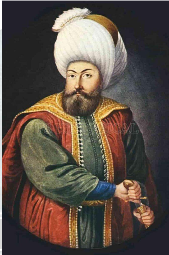
Osman Ghazi, the First Sultan & Founder of the Ottoman Empire