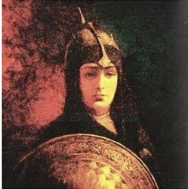
Rabia Bala Hatun, 1st wife of Osman Ghazi

Osman Ghazi had 2 wives. Whose names were Rabia Bala Hatun and Malhun Hatun . Osman Ghazi's first marriage was to Rabia Bala Hatun , who was the daughter of Sheikh Edbali , Sheikh Edbali was a great scholar at that time, and Osman was very close to Sheikh Edbali. Osman had a second child from Rabia Bala Hatun, named Alaeddin Pasha , and Alaeddin Pasha became the first military leader of the Ottoman Empire.