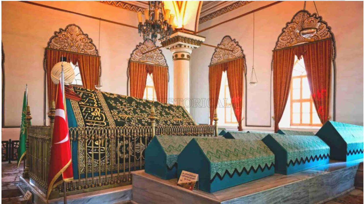
Tumba de Osman I, Bursa, Türkiye

Osman Ghazi's grave is now present in Bursa, Turkey. Osman Ghazi laid the foundation of the Ottoman Empire to fulfill his father's wish , Ertugrul Ghazi, and with a noble intention, his wish was that all Muslims and all Com-e-Muslims should gather under one flag.