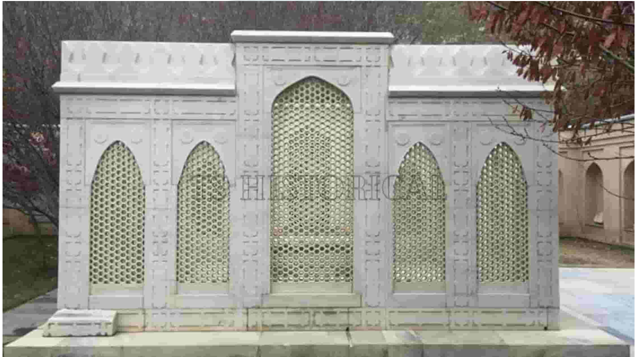
Tomb of Babur

Talking about the tomb of Babur outside, Babur had advised that after his death, he should be buried with his parents in his old homeland i.e. Kabul, so Babur was buried by his son Humayun in Babur Garden, Kabul, He was buried in (Afghanistan) itself, even today the tomb of Babur is present in the city of Kabul.