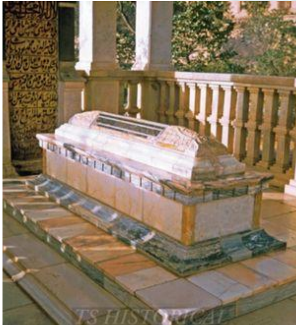
Death of Babur